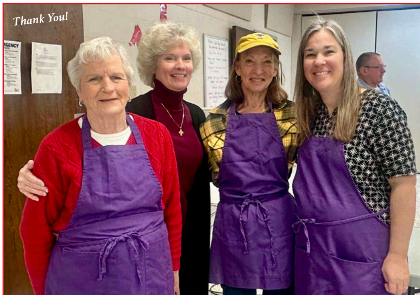
Catholic Daughters #249 hosted a great Kaffee & Strudel event for parishioners on 1/18.