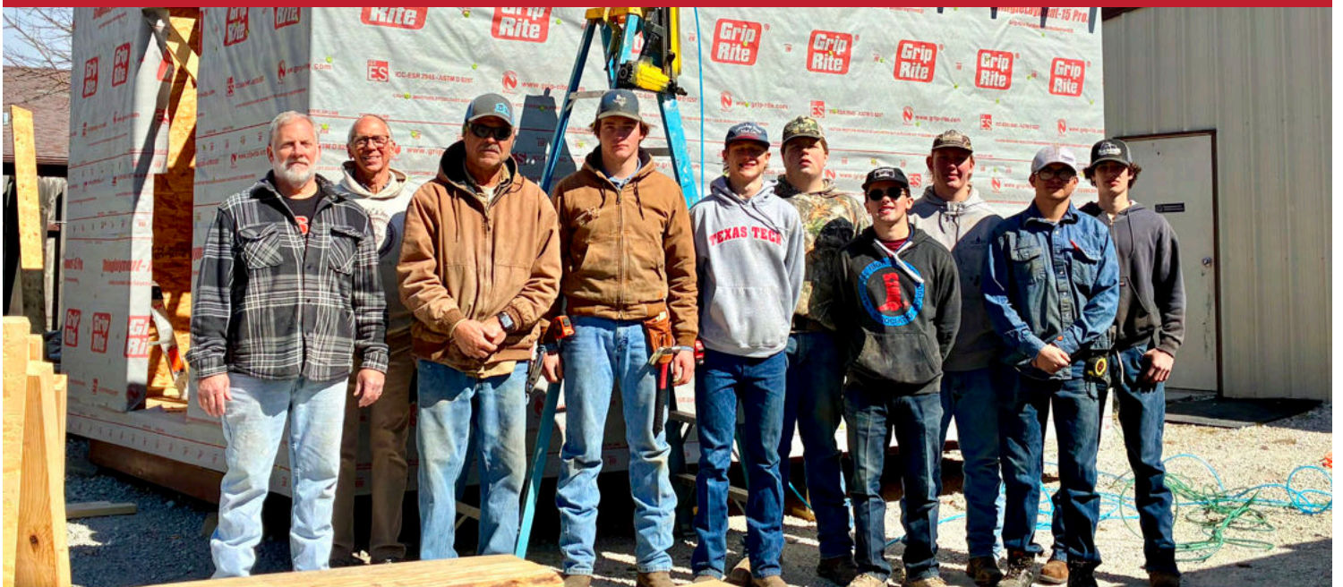
Sacred Heart high school students in St. Joseph's Workshop Program construct 'Speak Room' for Discalced Carmelites.

714 NORTH MAIN • MUENSTER, TX • MARCH 2026