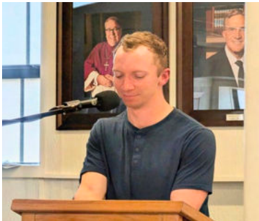
KC MEN'S RETREAT