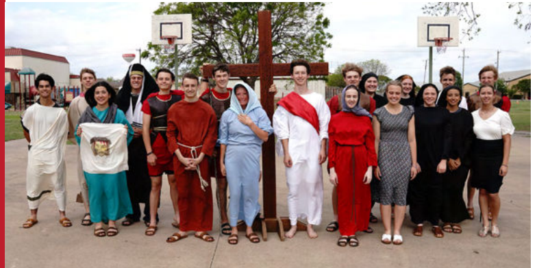
Good Friday ~ Live Stations of the Cross