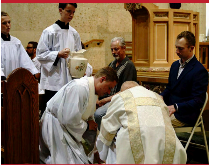
Holy Thursday ~ Mass of the Lord's Supper, Washing of the Feet